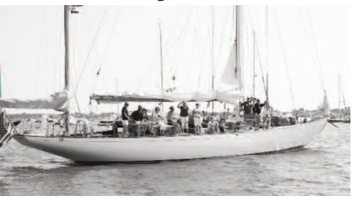
...a beautiful day of sailing for many of our patients & their guests